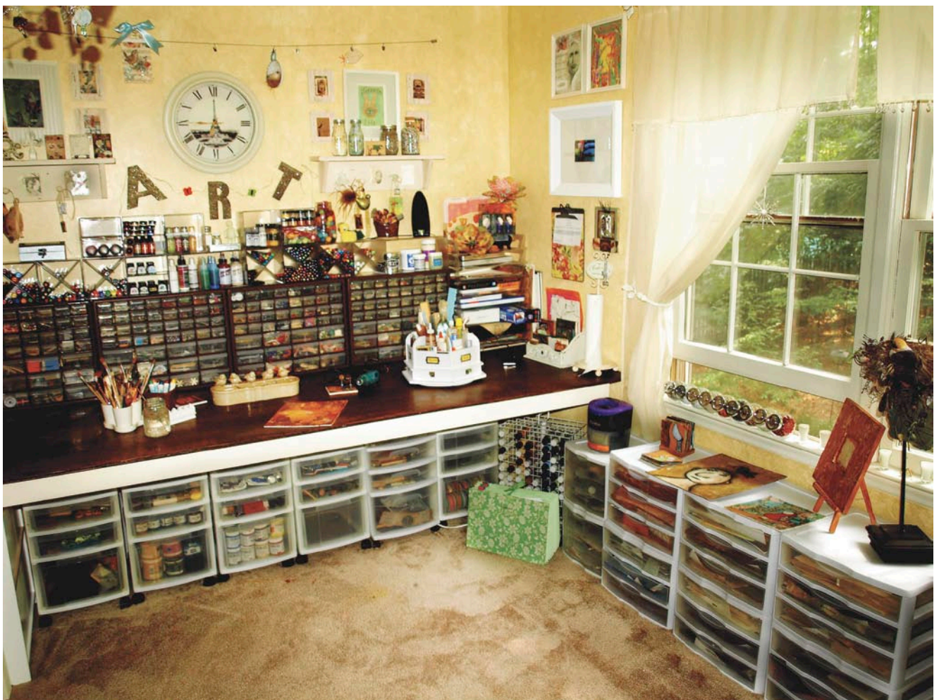
This page: Photo by Chrysti Hydeck. See Chrysti's studio in the Fall/Winter 2008 issue of Studios magazine.

Surround yourself with sound. What a difference it makes to design while listening to music and humming down memory lane to oldies on the radio. I find it relaxes me, makes me smile, and really inspires me to be creative. Beading while watching TV is great if you have all of your supplies within reach. I once tried to bead while watching a foreign film with subtitles. Doesn't work.