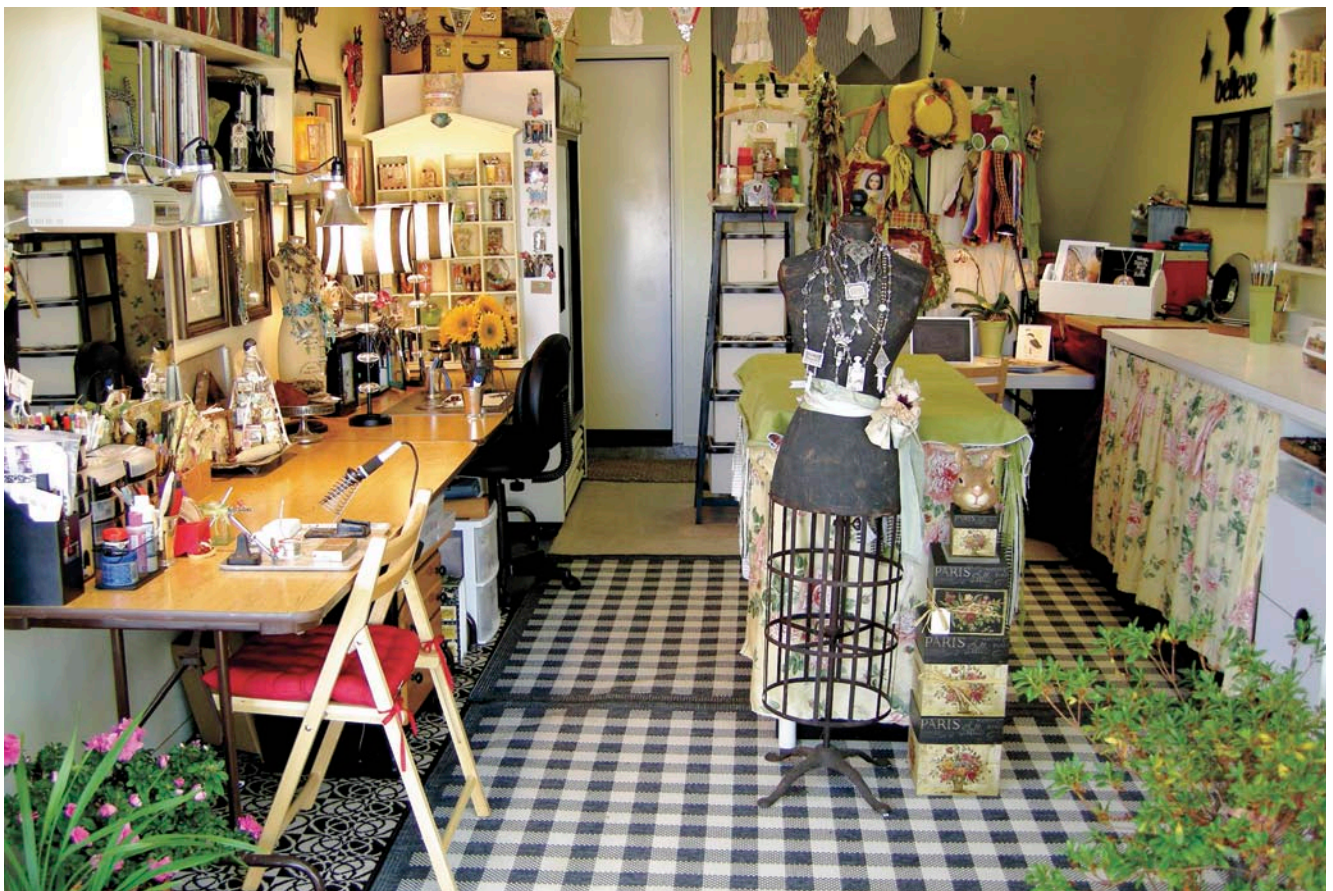
This page: See Diana's studio in the Spring/Summer 2009 issue of Studios magazine.